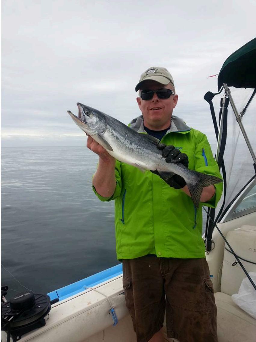
Me with one of the 18 salmon that we caught on the trip.