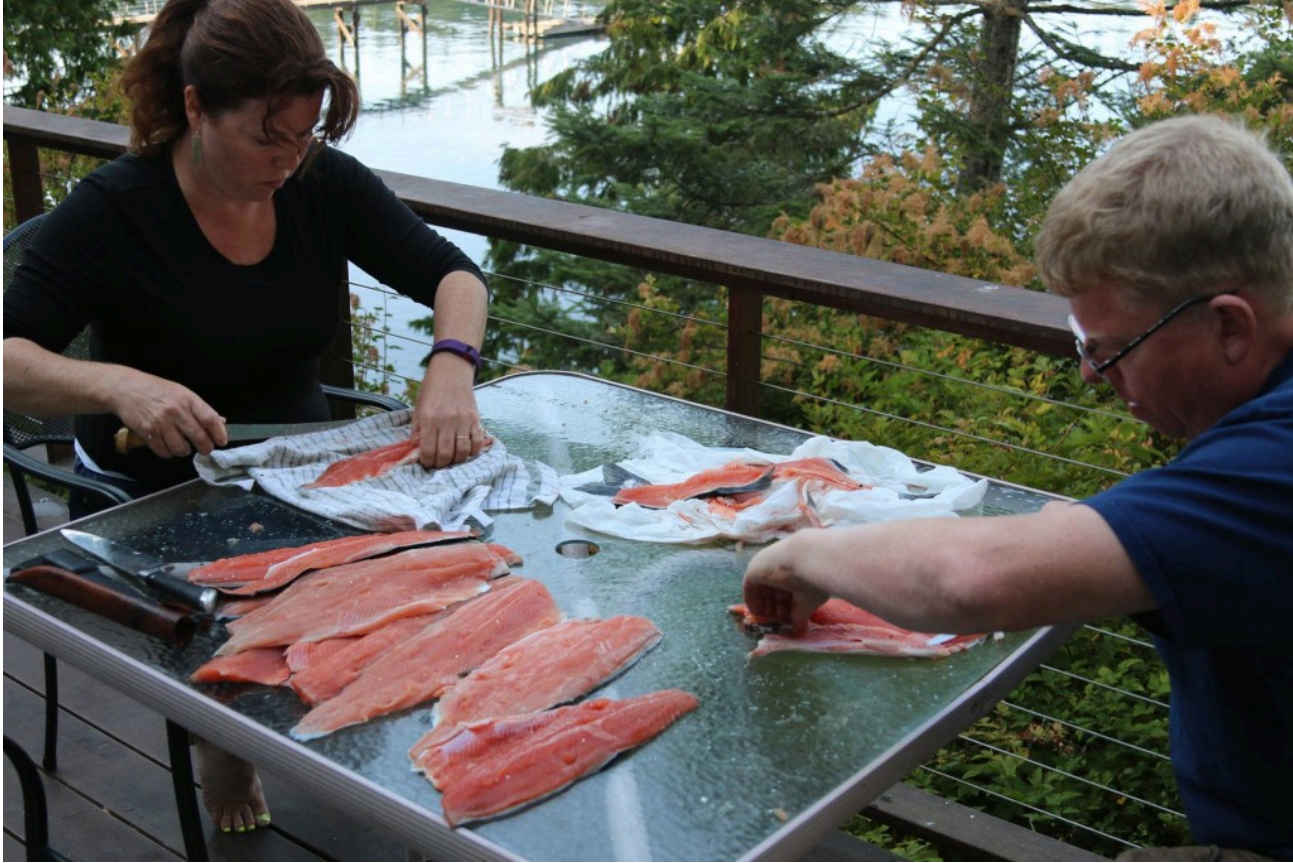
Preparing dinner after a day of catching salmon